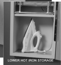
LOWER HOT IRON STORAGE